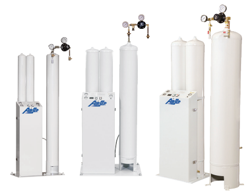
AS-A, AS-B and AS-D Mini Pack Generators